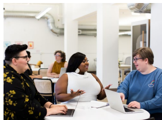
Support Circular Businesses