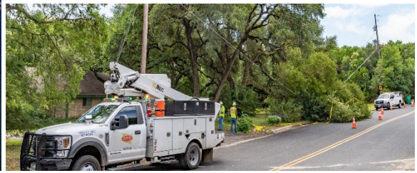
Lead by Example